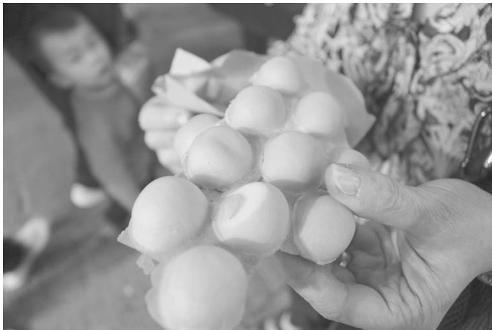
Waffles being sold on the street in Hong Kong.

Noodles are popular in Hong Kong, and because they're usually eaten in a bowl, many street-side restaurants serve a wide range of noodle preparations, sometimes